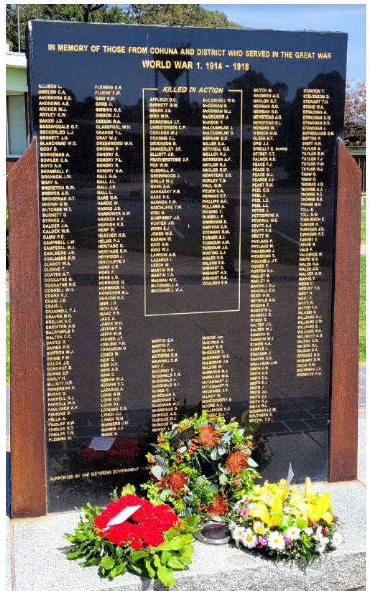
Remembrance Day 11th November 2023 WW1 Cohuna monument with beautiful wreaths for the fallen- never to be forgotten.

Garden Park 9am-1pm Next market Sunday 17th Dec 2023