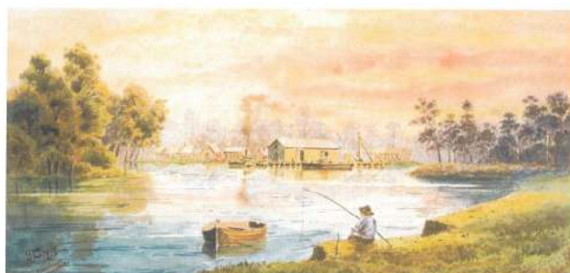
(T. Cravor, 1894. Koondrook Murray River)

Goods Shed, Koondrook Wharf 4-8pm Friday 27 th October, 2023